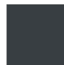
Grey RAL 7016