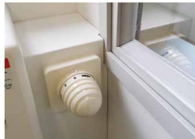
Bespoke OES with TRV Head